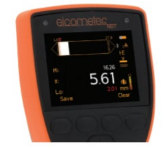
In scan mode the gauge takes readings at a rate of 16 Hz per second