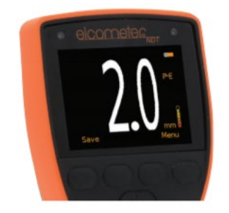
Large easy to read measurements

With a scratch and solvent resistant display, sealed, heavy duty and impact resistant design - dust and waterproof equivalent to IP54 - the MTG range is suitable for use in the harshest of environments.