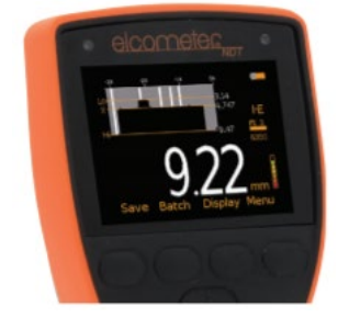
Cross Sectional 2D- B-Scan, ideal for relative depth analysis