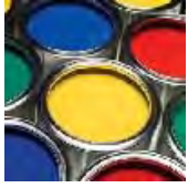
Paints and Coatings