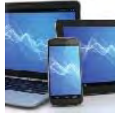
Smart Phone, Tablet PC and Laptop Covers