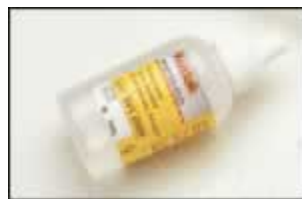
T27018024 Wetting Agent (50ml)