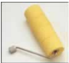
T27016960 Roller Wand and Roller Sponge T27018051 Spare Roller Sponge Set with Washer and Clip