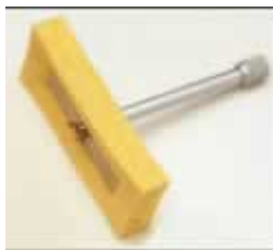
T27016867 Standard Wand with Flat Sponge T27018050 Spare Rectangular Sponges 150 x 60 x 25mm (Pack of 3 with a wing nut)