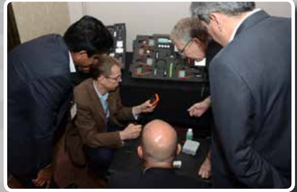
Exhibition at the Elcometer World Sales Conference

The main attraction at the sales conference was the preview of Elcometer's future product range development for the blasting industry, taking Elcometer and the blasting industry to the next level.