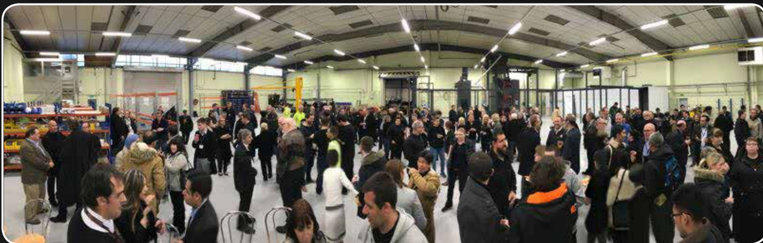
Celebrating 70 years of Elcometer with staff and distributors at our new Crabtree facility.