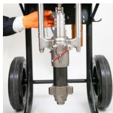
Disconnect the piston collars.