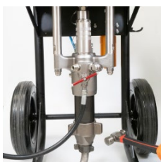
Loosen the fluid suction hose using a hammer.

Save time and money with maintenance in less than 20 minutes with no special tools!