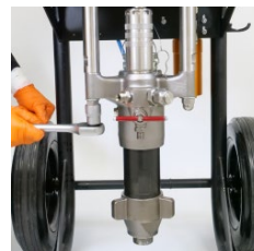
Using a wrench, remove pump from tie rods.