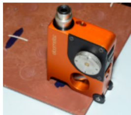
Position the gauge vertically so that the microscope lens is over the cut.