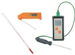
T1164441 Spirit Thermometer in °C T1164442 Spirit Thermometer in °F G212----1A Elcometer 212 Digital Pocket Thermometer with Liquid Probe G213----2 Elcometer 213/2 Digital Thermometer T9996390 Elcometer 213/2 Liquid Probe