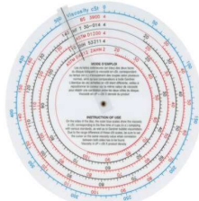
KT002400N003 Elcometer 2400 Conversion Disc Allowing viscosity (cSt) and flow times of different cups to be calculated. Front: No.4 cups according to AFNOR, BS, NF, ASTM, DIN, Zahn 2 Back: No.3-4-5-6 cups according to ISO and Zahn 3