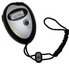
K0007300M201 Elcometer 7300 High Precision Stopwatch