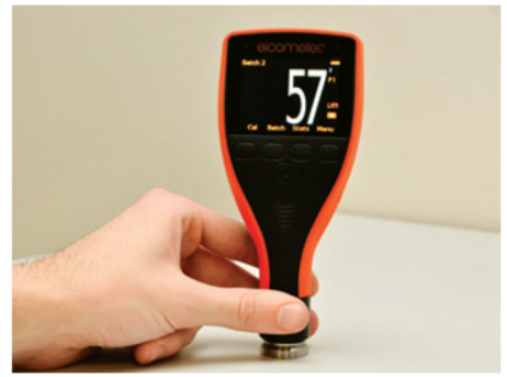
2.4" Colour screen provides enhanced reading visibility at all angles