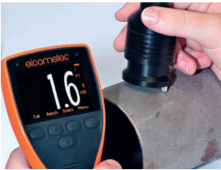
Integral or separate probes measure profiles up to 500 microns on flat or curved surfaces*