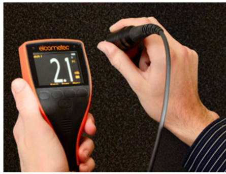
Ergonomic design for comfort during continuous use