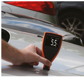
Measures on steel & aluminum body panels 1