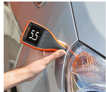
360° auto rotating display for measuring at any angle