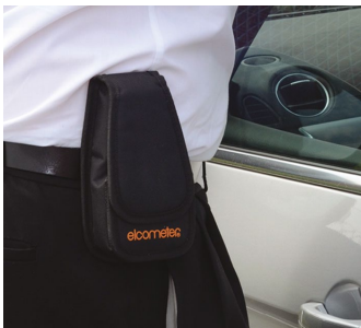
Durable & impact resistant case clips straight onto your belt

Robust, durable & weather resistant, the new Elcometer 311 is available with a 2 year manufacturer’s warranty; giving you a peace of mind.