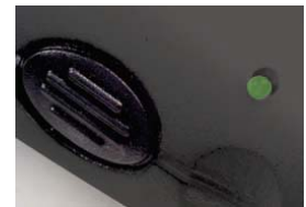
New enhanced stay-on trigger with LED indicator

The '2-In-1' Scope System features the flexible, thin ability of our 6 mm shaft along with an additional 'Obedient' shaft that can be added easily to give you the ability of 2 scopes in one package! Thin and flexible in 6 mm configuration and obedient to your desired shape. All your customer has to do is unscrew the base cap and thread the obedient shaft onto the end of the scope. With-in minutes you have an 'Obedient' scope! The '2-In-1' scope system also utilizes the finest in accessories. Featuring a more solid threaded design, you can attach a magnet or a 90 degree side view mirror with less fear of it falling off. The '2-In-1' Scope System comes complete with screw-on obedient shaft, threaded mirror, threaded magnet and extra bulb.