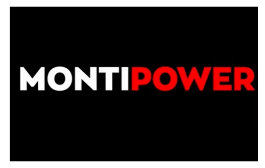
Welcome to the world of MONTIPOWER!