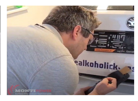
Remove Car Signage easily with the MontiPower Vinyl Zapper