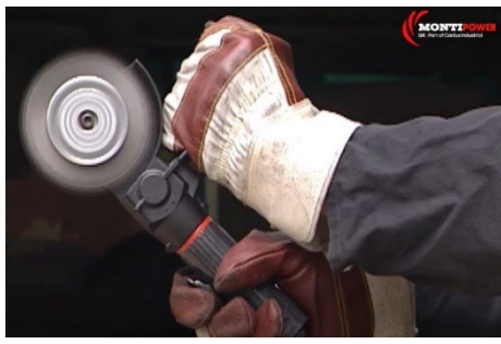
MBX® | Remove Rust, Corrosion, Adhesives, Undercoating & More