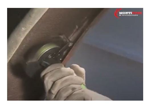
Transport For London Traincare: With MontiPower