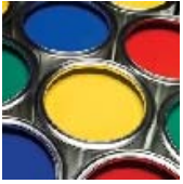
Paints and Coatings