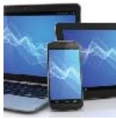
Smart Phone, Tablet PC and Laptop Covers