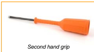
Second hand grip

The integrated automatic voltage calculator allows the user to simply enter the coating thickness value and select the standard and the gauge will automatically set the correct voltage. The gauge also features an internal jeep tester, removing the need for two gauges. The closed loop system with internal voltmeter guarantees the voltage output at all times.