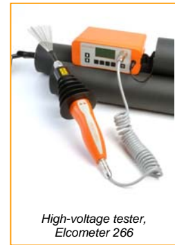
High-voltage tester, Elcometer 266

To test the thicker enamel found in chemical reactors, a high voltage probe is necessary, according to ISO 2746. The Elcometer 236 or 266 can be used for this test. With the return lead connected between the instrument and the vessel, the brush probe is moved along the surface of the enamel. A spark will jump where the enamel does not provide sufficient insulation to prevent it, triggering the alarm. This test also finds cracks and weak spots in eroded enamel, especially inside reactors that have been used with strong acids and chemicals.