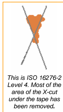
This is ISO 16276-2 Level 4. Most of the area of the X-cut under the tape has been removed.