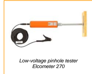
Low-voltage pinhole tester Elcometer 270

The tests for pinholes are described in ISO 8289. For the Type A test, a low-voltage tester with a wet sponge is used, such as the Elcometer 270 switched to 9 volts. One terminal of the tester is connected to the