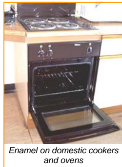
Enamel on domestic cookers and ovens

The thickness of vitreous enamel on a steel substrate is measured using an F-type probe but first, the gauge should be calibrated to a similar uncoated item.